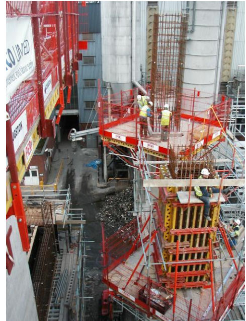
Feed hopper columns – Sheffield ERF