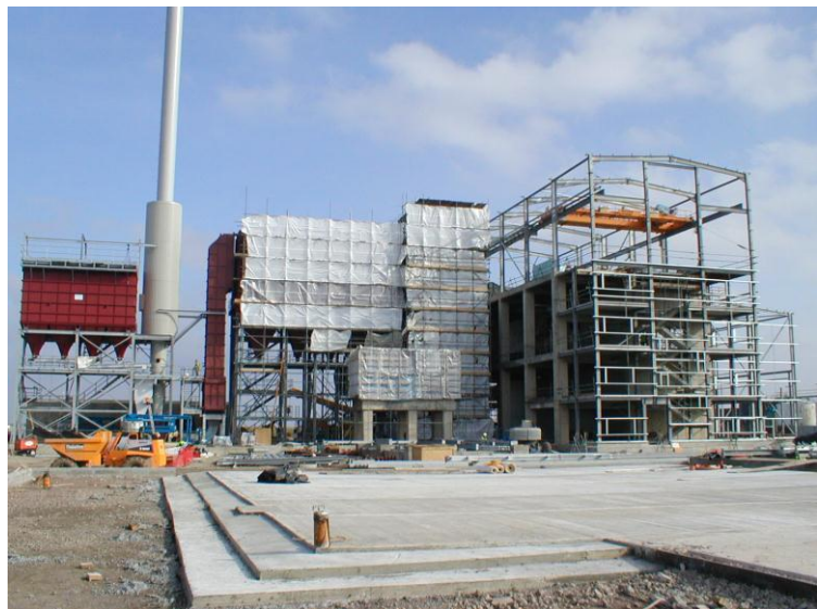
Boiler Structure - Grimsby EfW