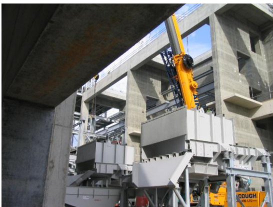
Ash handling area - Riverside EfW