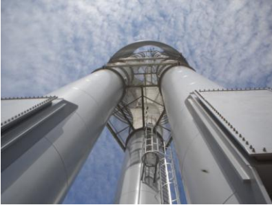
Stack - Lakeside EfW