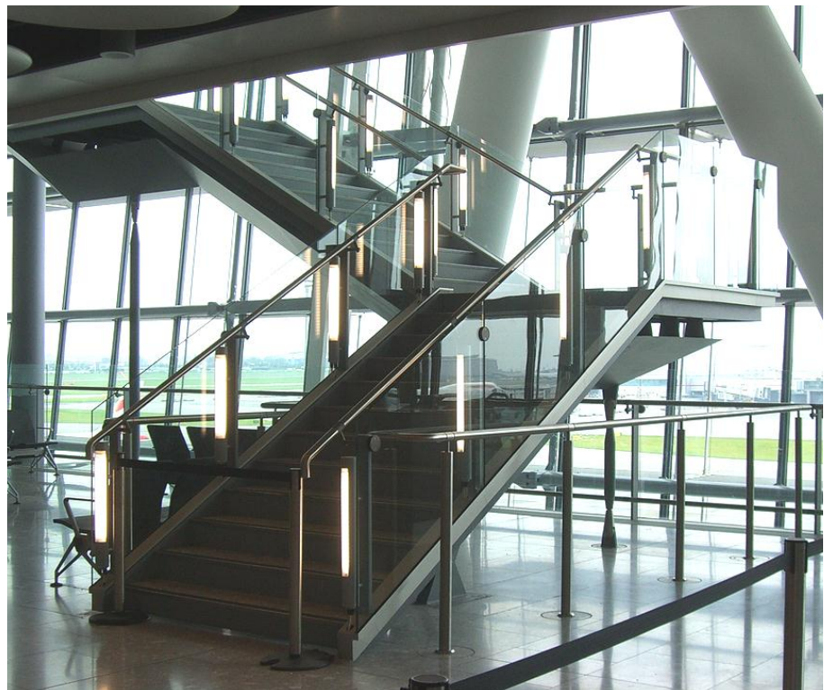
Heathrow Terminal 5