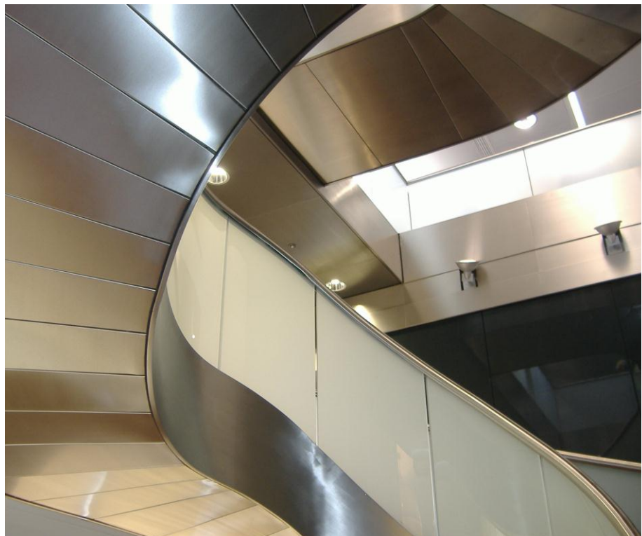
St Pancras 1 st Class Lounge

Our philosophy is to deliver the architectural and engineering requirements of the scheme, whilst considering the cost and ease of fabrication.