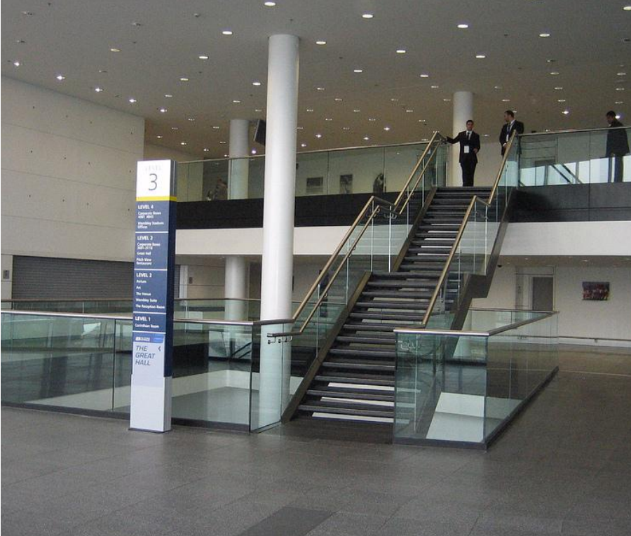
Wembley Stadium VIP Areas

Melia Smith & Jones has amassed considerable experience in the design of architectural staircases for prestigious projects throughout the UK.